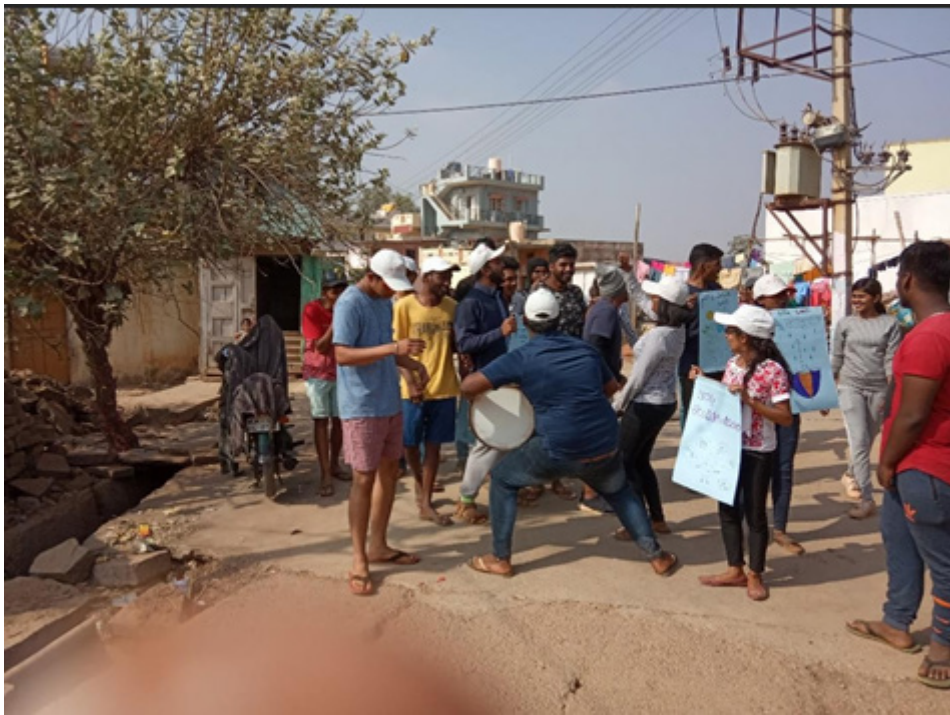
Figure: Awareness program by NSS students