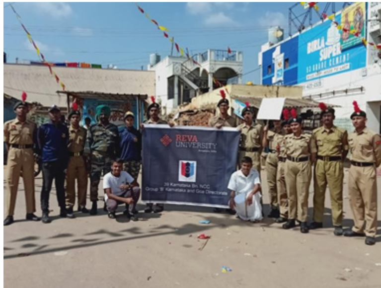
Awareness program on fecal sludge management