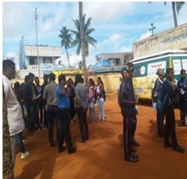
Awareness program on ODF and waste management