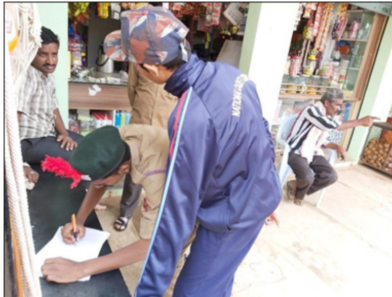
Door to door awareness on fecal sludge management