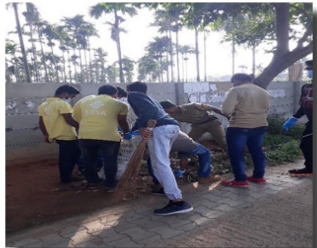
Figure 3 and 4: Students Cleaning