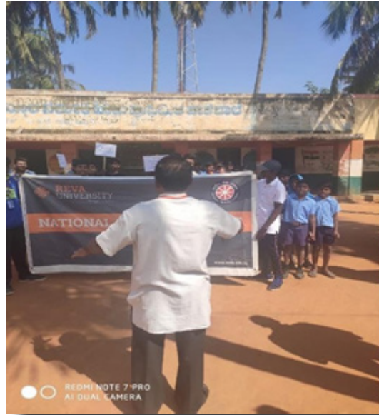
Rally on usage of soap while washing hands