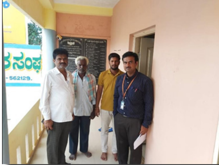
HEI Nodal Officer with village officials