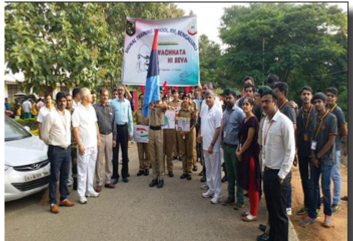
Figure 2: Staff and student participation