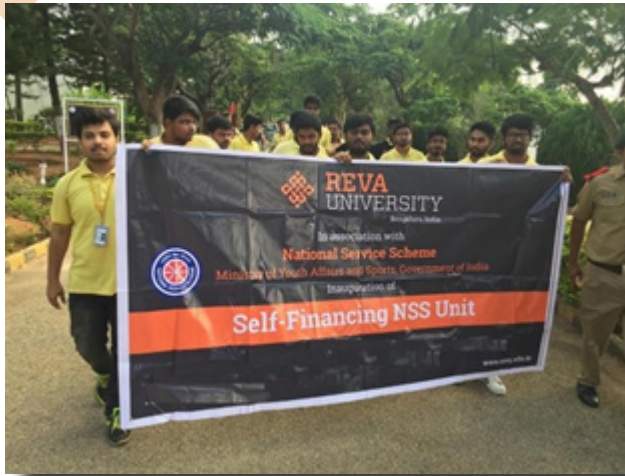
Figure 1: NSS students with Banner