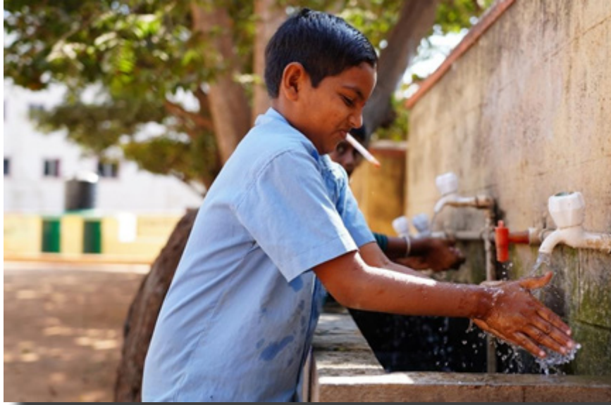
Students are washing their hands on visit to toilet