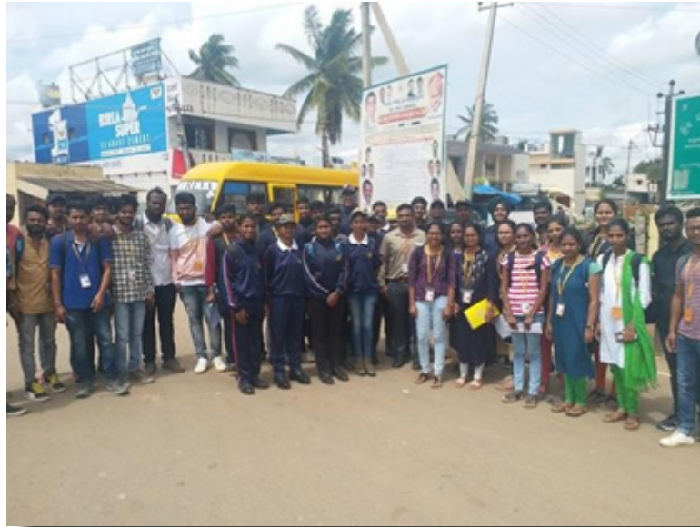
Awareness program on rain water harvesting techniques