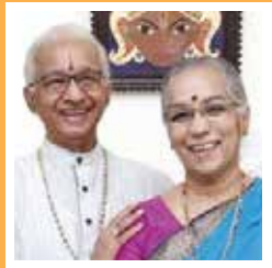
'Padmabhushan' Dr. Dhananjayan