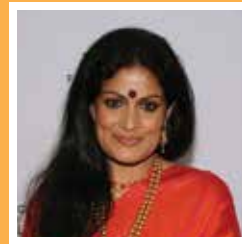
'Padmasri' Geeta Chandran, New Delhi